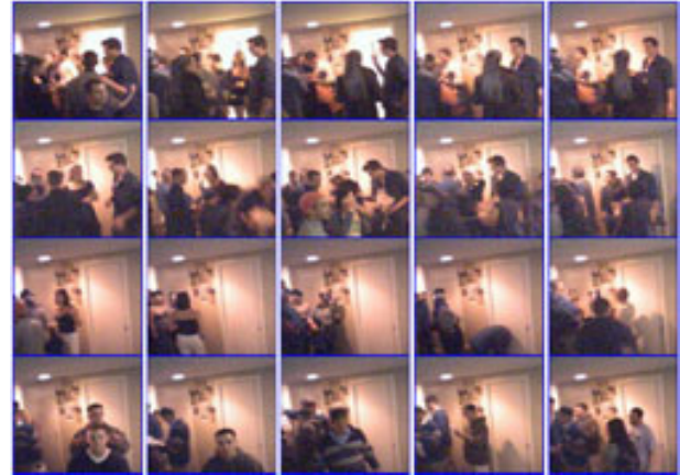
Figure 1. Pictures taken, printed and posted to the web by the iVSI system at an installation.

IvsI is designed so that its visitors identify, encode, organize, reorganize, interpret, and act upon the information presented through the installation, so that they might develop a deeper understanding of the issues around information capture and trust. These issues are presented through an artistic experience rather than a traditional interactive exhibition format because we are interested in exploring how perceptual and conceptual art can be used to communicate technological concepts and invoke corresponding emotional and rational responses. The aesthetic principle of our design is based, in large part, on each visitor's ethical notion of privacy. Regardless of the visitor's preconceived notions about information capture, trust, and whatever other concept they map to the messages delivered by the installation, each visitor performs a moral assessment of the information presented to them. For this reason, IvsI is especially satisfying and challenging to